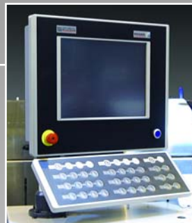
“Mosaic” Microprocessor Control